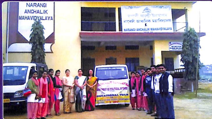
Department of Political Science