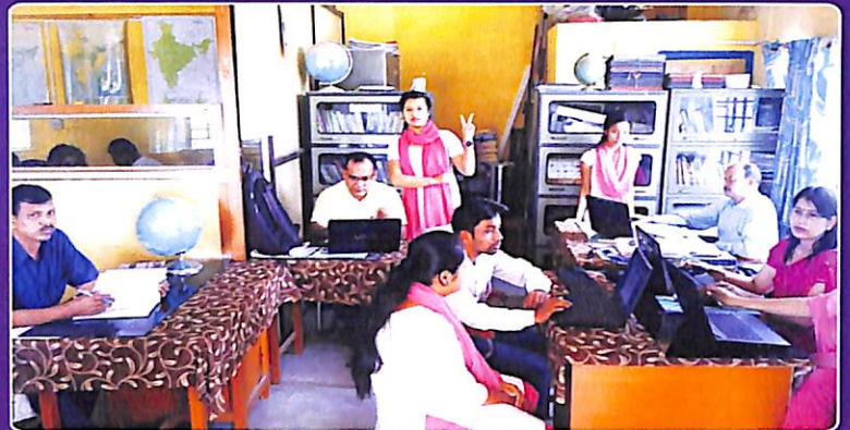
Department of Geography