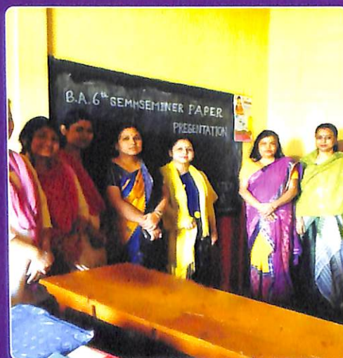
Department of Education