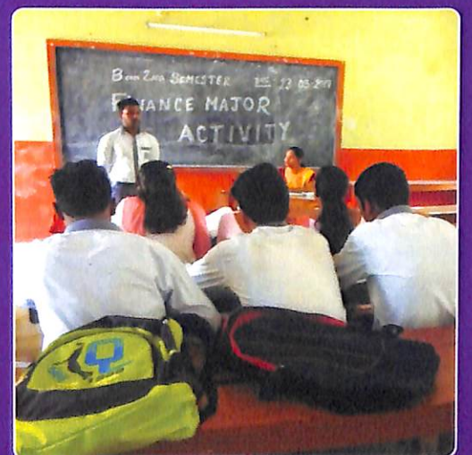
Commerce (Finance Department)