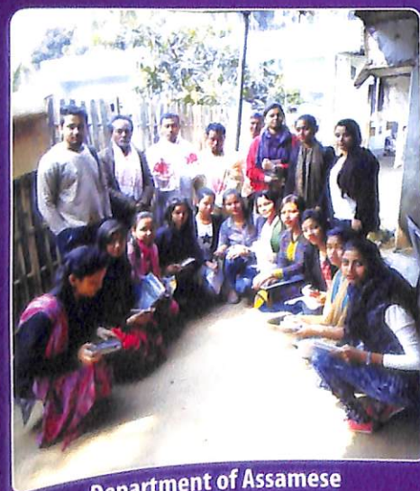
Department of Assamese