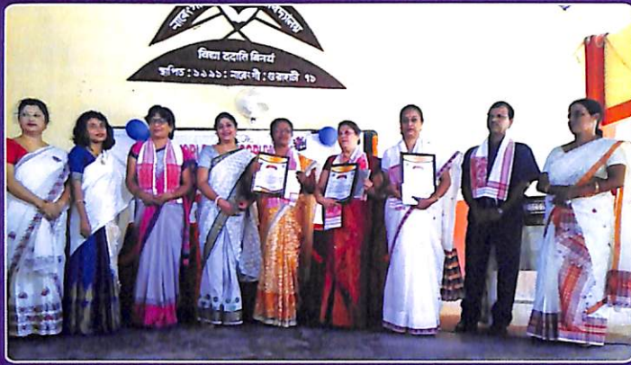
Department of Philosophy