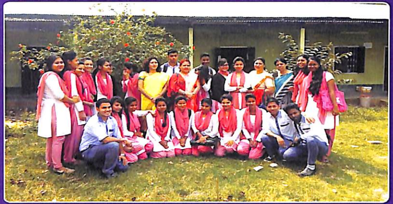
Department of English