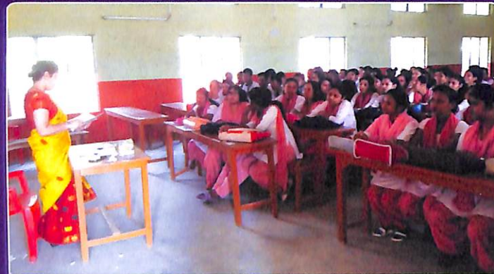
Department of Environmental Studies