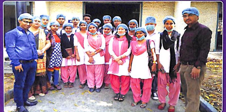
Department of Economics